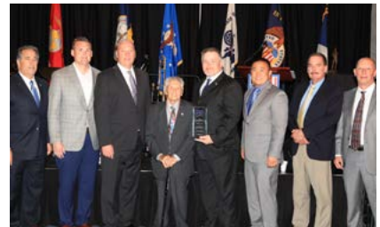
2019 AWARD RECIPIENTS