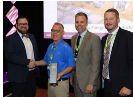
2022 AWARD RECIPIENTS

Barton Malow Company Lansing Power Constructors Michigan B.C.T.C.